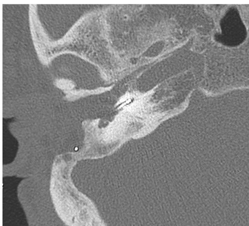
Fig 2. Postoperative CT scan of Patient 2 (right ear).

out. Obliteration of the mastoid was not carried out. Complications, hearing threshold results, word recognition, and bleeding were the four items analyzed in these seven cases. Permission for this retrospective study was obtained from the Kanazawa University Hospital, the local Ethics Committee approved the study protocol. Informed written consent was obtained from all patients.