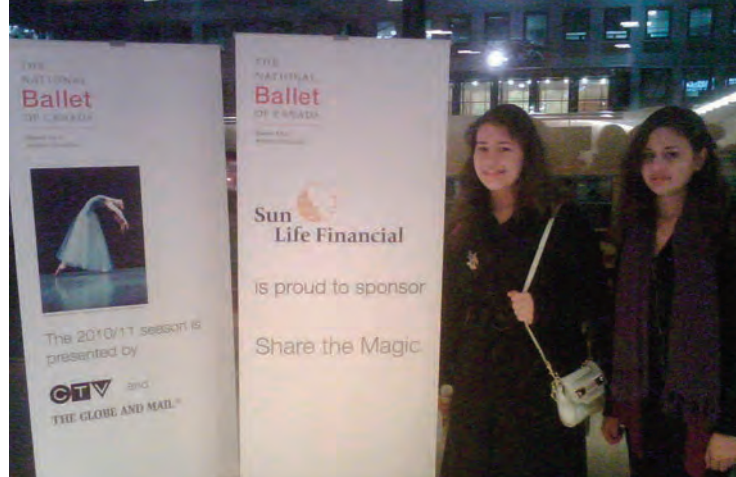
At the Nutcracker ballet.